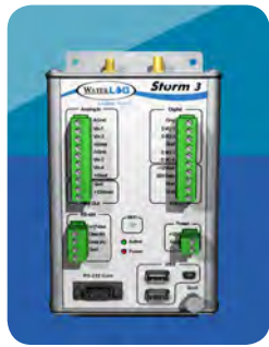
WaterLOG Storm 3 wireless telemetry. Real-time data monitoring.