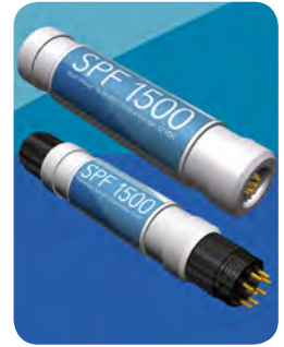
SPF1500 protects against fluctuations in power and communications over long cable lengths.