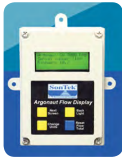
Easy-to-use Argonaut Flow Display for viewing SL500 data and system status.