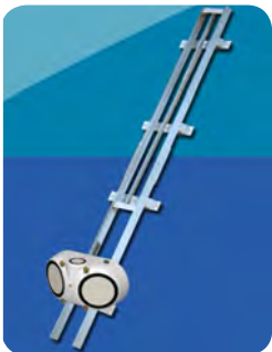
Canal Mount for installation in open channels.

Useful options and accessories make the SonTek-SL a complete, turn-key solution!