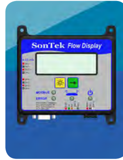
Easy-to-use SonTek Flow Display for viewing SL (3G) data and system status.